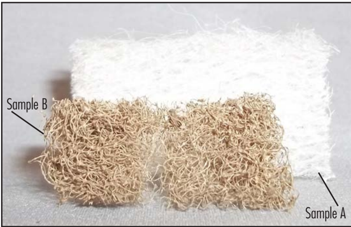
Figure 1. (Profile View)

Samples A and B shown above were both taken from the same Full Cycle® floor pad. While Sample A was left untouched, Sample B was placed in an ASTM D5511 simulated landfill test for 290 days. Note the significant mass reduction via enhanced biodegradation in Sample B.