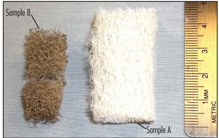
Figure 2. (Overhead View)

Samples A and B shown above were both taken from the same Full Cycle® floor pad. While Sample A was left untouched, Sample B was placed in an ASTM D5511 simulated landfill test for 290 days. Note the significant mass reduction via enhanced biodegradation in Sample B.